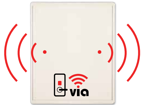
UNIVERSAL HUB LOCATED UP TO 70/170 FT. (21/52 M) AWAY